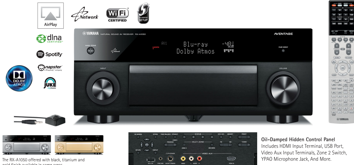
The RX-A1050 offered with black, titanium and gold finish available in some areas.

Offers Dolby Atmos® and High-grade audio with the latest ESS DAC, a Symmetrical Amp layout and a Rigid Chassis. This 7.2-channel AVENTAGE Network AV Receiver also features 4K Ultra HD full support with 7-in/2-out HDCP2.2 compatible HDMI terminals.